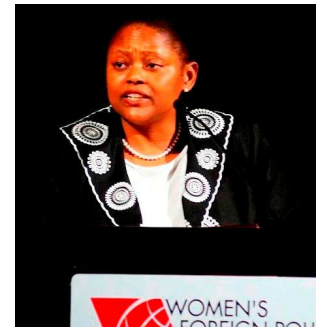
Jendayi Frazer, Assistant Secretary of State for African Affairs.

The WFPG would like to thank the patrons, sponsors, supporters, special friends, host steering committee members, honorary committee members and WFPG board members who helped make the luncheon such a success. The Women's Foreign Policy Group depends on such generous support to continue its mission of promoting women's leadership and voices in international affairs.