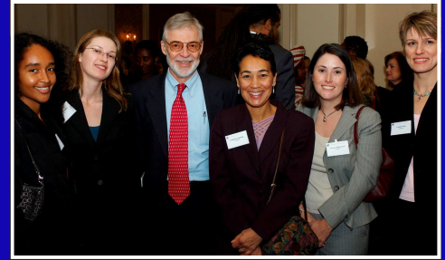
Attendees from NAFSA: Association of International Educators.