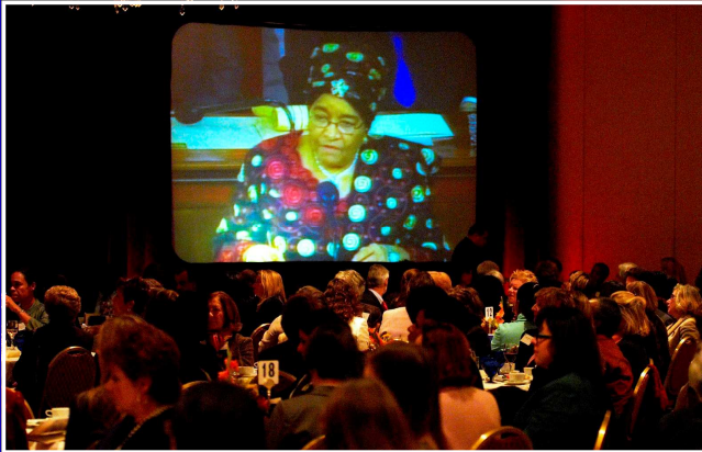
President Ellen Johnson Sirleaf in video address.