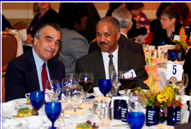
Ambassadors of Portugal and Mozambique.