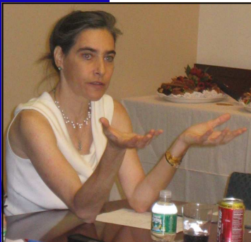
Sarah Chayes at WFPG meeting in New York.

Former NPR correspondent Sarah Chayes spoke to the Women’s Foreign Policy Group about her new book, The Punishment of Virtue: Inside Afghanistan After the Taliban , a personal account of her four years spent working with Afghans to rebuild their country following the fall of the Taliban.