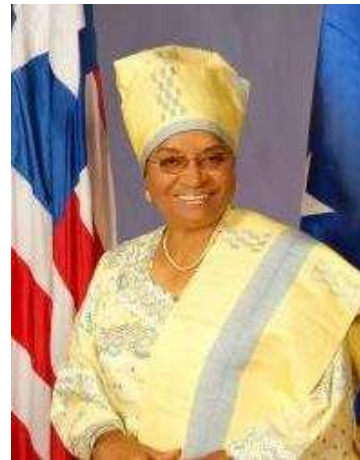
H.E. Ellen Johnson Sirleaf, President of Liberia.

At the Luncheon, the WFPG also announced its first international grant awarded to the Ellen Johnson Sirleaf Market Fund for Women. Through provision of infrastructure, skills training, and financial tools, this sub-fund of the African Women's Development Fund, will work to strengthen all Liberian market women, a goal of personal importance to President Sirleaf, whose grandmother was a rural Liberian market woman.